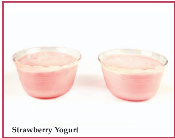
Left: Retail yogurt containing Carmine Right: Yogurt using colorMaker™ custom blend